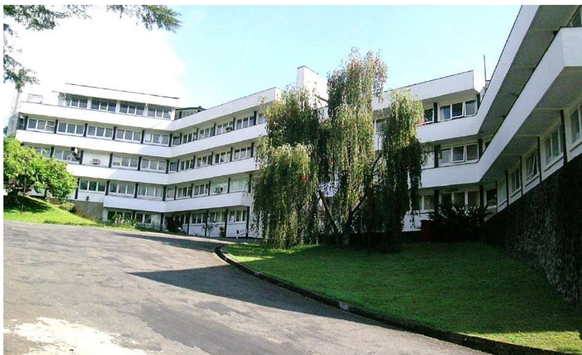
Tea Research Institute of Sri Lanka (TRISL) Talawakelle, Sri Lanka

Advisory and extension services have been recognized as a prerequisite for the development of tea industry in Sri Lanka since the colonial period. The Tea Research Institute of Sri Lanka (TRISL) shoulders the main responsibility for generating knowledge and disseminating information to tea growers. Among the various advisory and extension approaches initiated by TRISL, cyber extension interventions play a vital role in knowledge dissemination while improving accessibility, ease of use, user-friendliness, accuracy, and speed of delivery. The main objective of ICT initiatives of TRISL is to ensure cost-effective and efficient dissemination of TRISL recommendations and information to tea growers, extension officers, and other relevant stakeholders, thus improving the level of adoption. The main ICT initiatives of TRISL are discussed below.