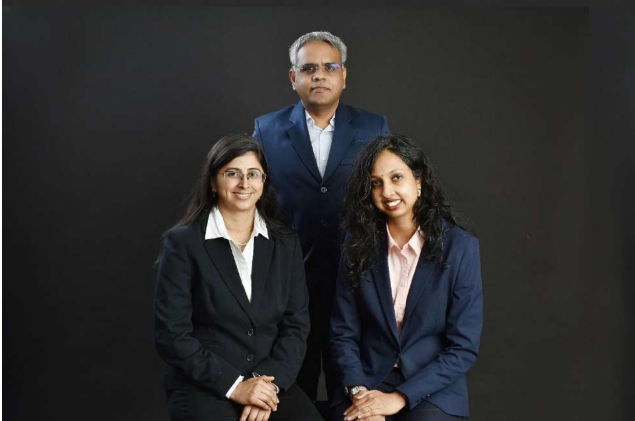
RenKube's Founding Team

Our journey began during our time at Cisco, where we successfully collaborated on various projects, forming a strong bond and deep understanding of each other's capabilities. This synergy, combined with our technical expertise, has been pivotal to RenKube's journey since 2017. Our main mission at RenKube is to implement innovative renewable energy solutions by converting any surface exposed to the sun into an energy generating unit. This includes a wide range of products related to solar energy, such as in-building integrated photovoltaics (solar panels incorporated into the structure of buildings like roof or wall), solar balcony (like solar panels integrated into glass facades in the balcony), and rooftop solar. Our vision is to change the way people use solar energy in their daily lives, making it a ubiquitous choice in all walks of life.