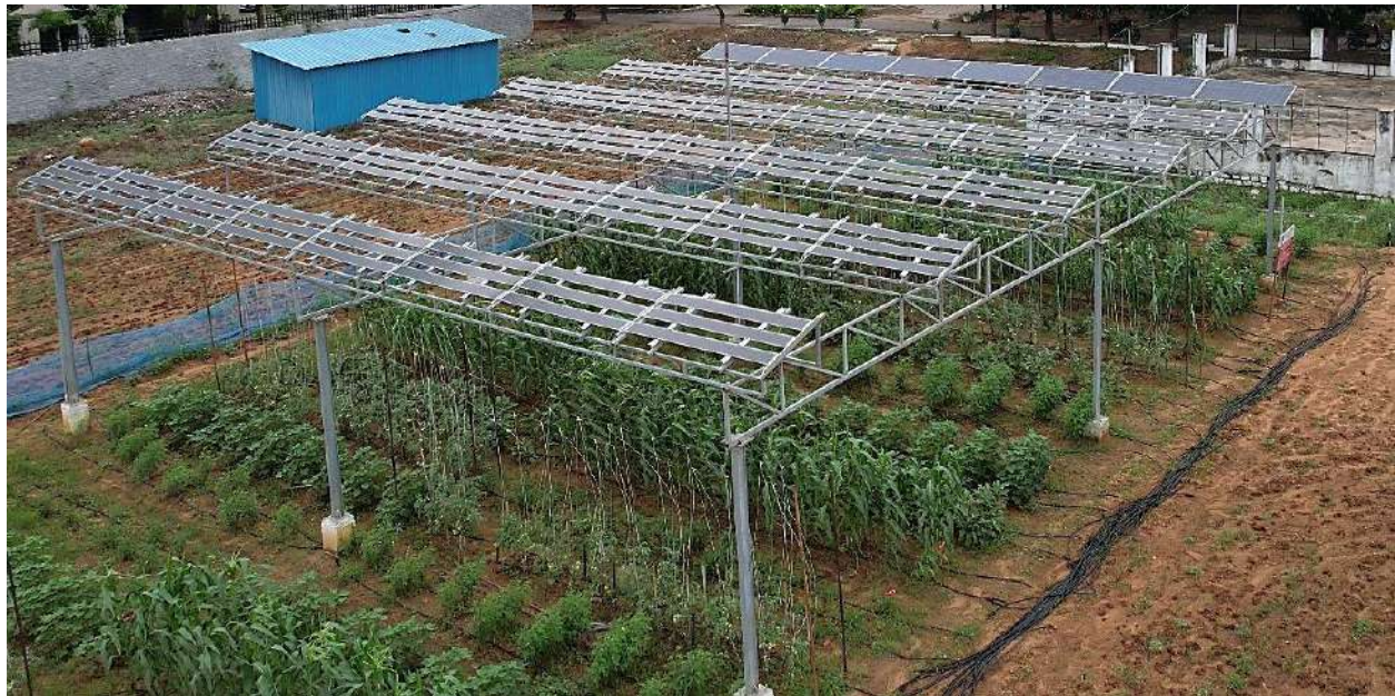
RenKube solar panels in the field

Currently, our focus is on two product lines – the Agri PV panel “ Krishi ” that is designed for dual use in the same land and the second product is the energy efficient PV panel “ Adi ” that focuses on improving the energy yield in solar panels by up to 40% by capturing more sunlight with our patent-pending light redirecting prisms. Both the products align with our vision of driving the clean energy transition in India and making efficient use of available resources, whether for agricultural productivity or enhanced solar energy generation.