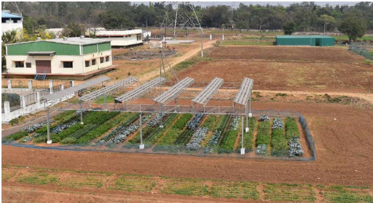
RenKube solar panels in the field.

At the same time, solar developers now have access to land, thereby reducing pressure on them to acquire dry and arid sites. This concept can be extended to industrial districts, where MSMEs can invest in nearby farmland for solar power generation and contribute to a carbon neutral world while supporting local farmers. India's ambitious target of generating 450 GW of renewable energy by 2030 requires innovative solutions. Our approach allows us to expand solar installations without competing for valuable land resources enabling a win-win scenario for the clean energy transition. This transition not only reduces carbon emissions but also improves the livelihoods of India's farmers who are an important part of the country's economy.