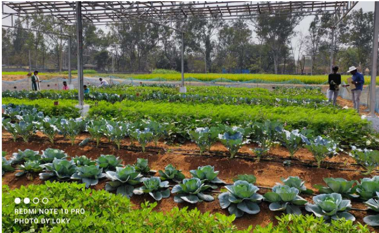
Crops under AgriPV Pilot.