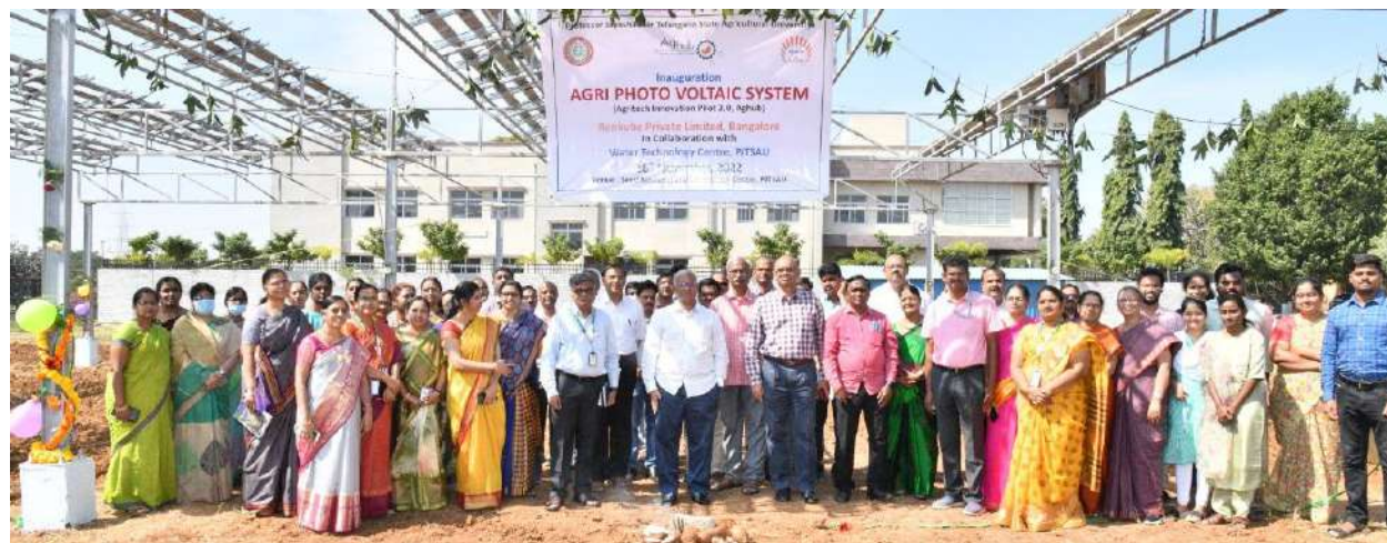
Pilot inauguration of Agri PV system at PJTSAU