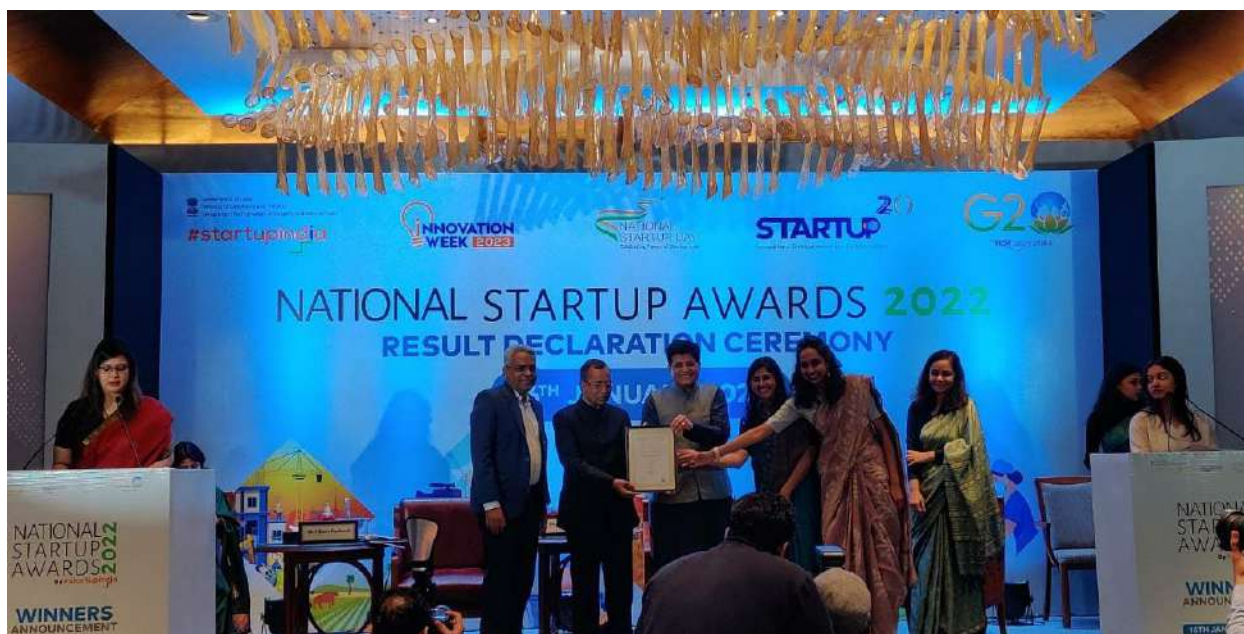
Receiving National Startup award 2022