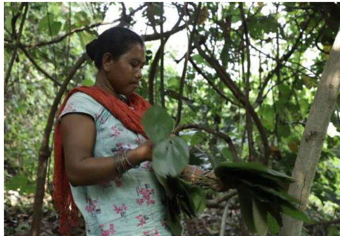
Siali leaves collection from the forest

Our on-the-ground experiences have demonstrated that local forest governance holds the key to revitalizing forests. PRADAN has been at the forefront of promoting community forest governance, contributing to both forest conservation and socio-economic advancement. As we progress, it is imperative that we replicate and expand such initiatives that guarantee a sustainable future for India's forests and ensure the overall well-being of forest inhabitants.