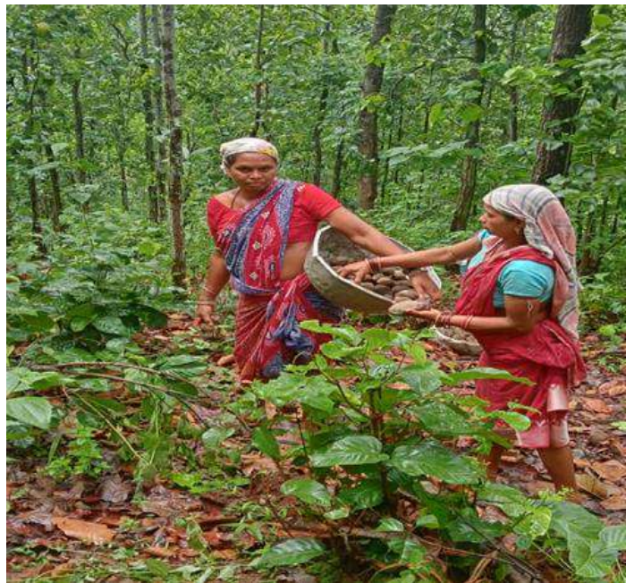
Restoring the forest with seed balls

With support from the forest department, they obtain native forest saplings for afforestation. The continuous watch and ward by the community has led to denser forests in many villages, enhanced quality and production of Non-Timber Forest Products (NTFP), increased uncultivated safe and nutritious food, led to greater number of butterflies, birds, monkeys and peacocks in forests, and more water in streams enabling the cultivation of a second crop. The story of impact is given in Box 2.