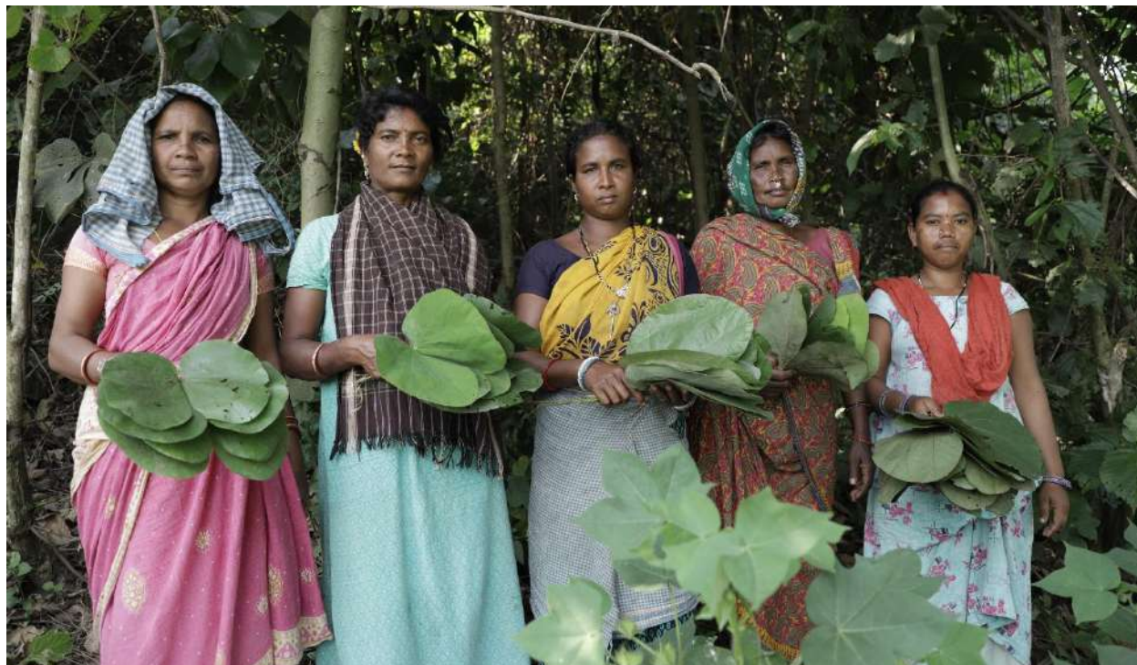
Women collecting Siali leaves for leaf plate making

In the heart of India's Central Tribal Belt, where indigenous communities have safeguarded the forest ecosystem for generations, a remarkable transformation is taking place. PRADAN, one of India's biggest national-level NGOs, has been actively involved in the recognition and implementation of forest rights. The Scheduled Tribes and Other Traditional Forest Dwellers (Recognition of Forest Rights) Act, 2006 or the Forest Rights Act (FRA) - 2006, is one of the most important and popular entitlement-based laws enacted in India favoring tribal and other traditional forest dwellers' rights over forest land (Box 1).