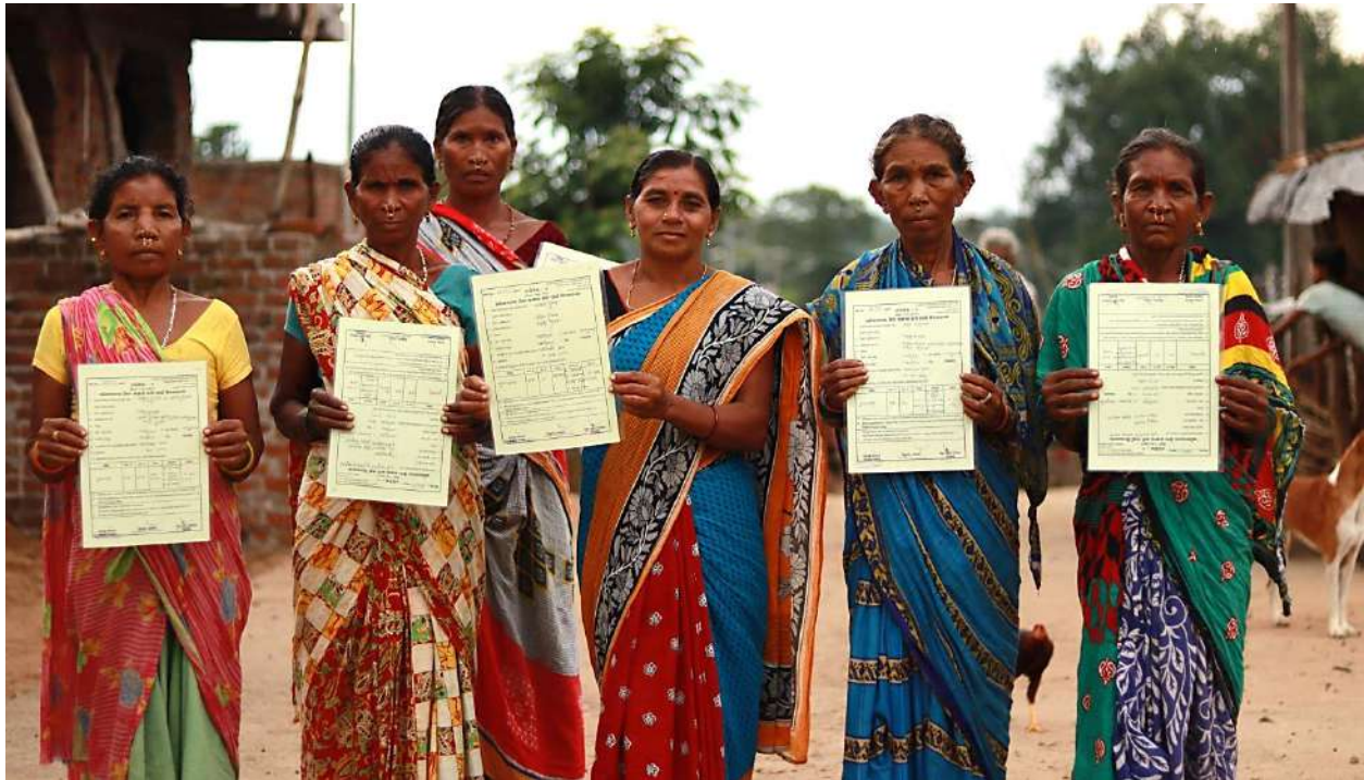
Single women with their land titles