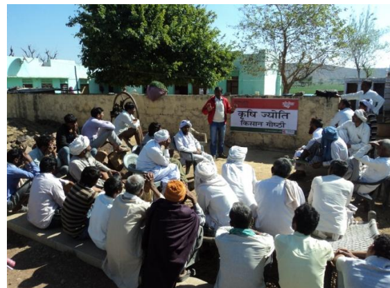
Farmer meetings organised under Krishi Jyoti Project

Field Days: To sensitize and increase adoption of the package of practices, Field Days are also organized. Field Days provide farmers an opportunity to observe differences in crops between a demonstration plot and a control plot. These are meant for disseminating information on the scientific package of practices. In 2017, 45 Field Days were conducted in which 1791 farmers participated.