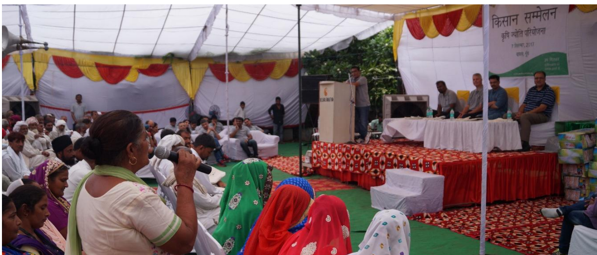
The Sammelan witnessed equal participation of women farmers