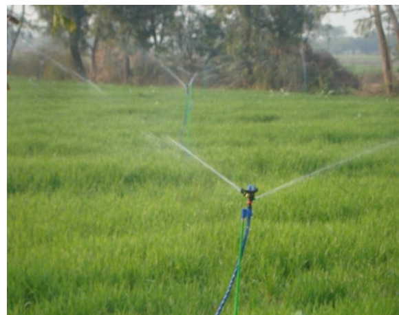
Sprinklers installed under Krishi Jyoti Project

Formation of VDCs: For maintaining sustainability of structures built under the project, like check dams, Sehgal Foundation forms Village Development Committees (VDCs) which put villagers into leadership roles that make them responsible for the operation and maintenance of these structures. Community contribution is collected to create a feeling of ownership among beneficiary communities. These contributions are channelized into maintenance funds managed by VDC members. This ensures long term sustainability of the physical infrastructure.