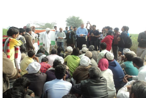
Field Day event organized on demo plot