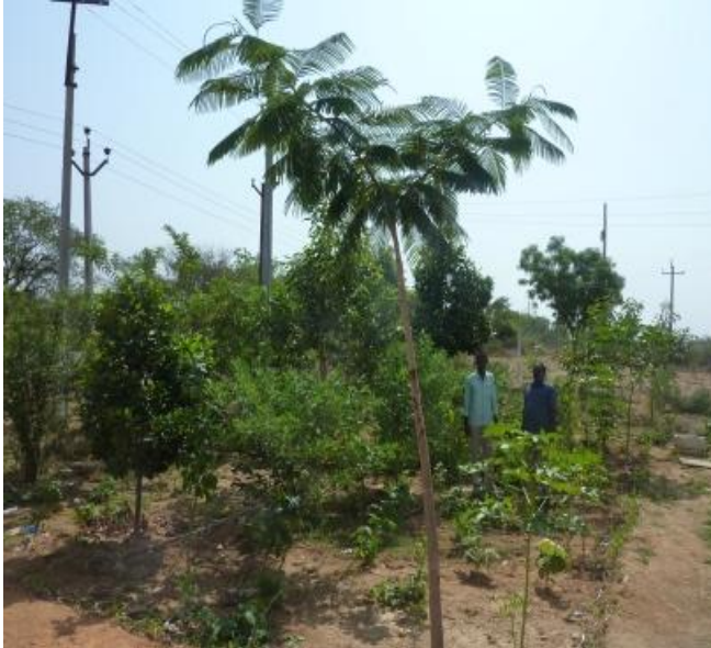
Demonstration of a multi-storied cropping model in Vayalpadu village

and provide feedback. They hold regular videoconferences with DPMs and face-to-face meetings on a monthly basis. A designated representative of PMU for a district visits project locations in that district on a monthly basis to monitor implementation of activities.