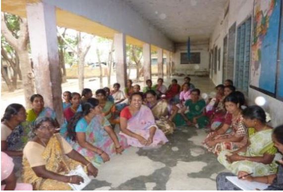
A typical training/interaction session conducted by CA and VA in Chintaparthi village.