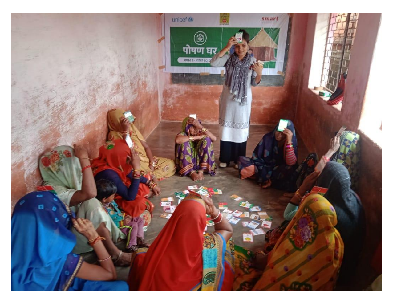
Participatory learning session with women

them. Once trained at Radio Bundelkhand, these women can become trainers and build other women's capacities.