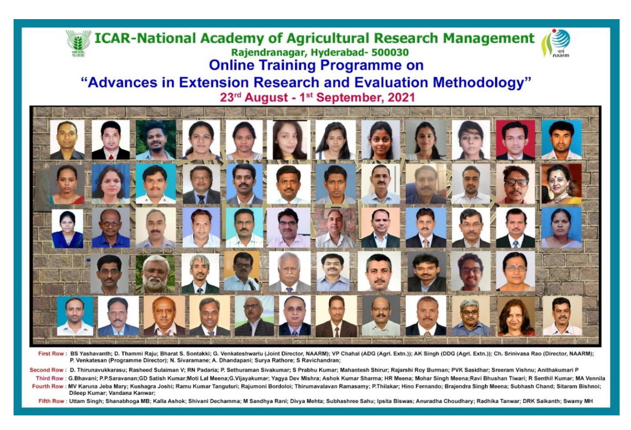
Figure 3 Trainers and Participants of the Training Programme