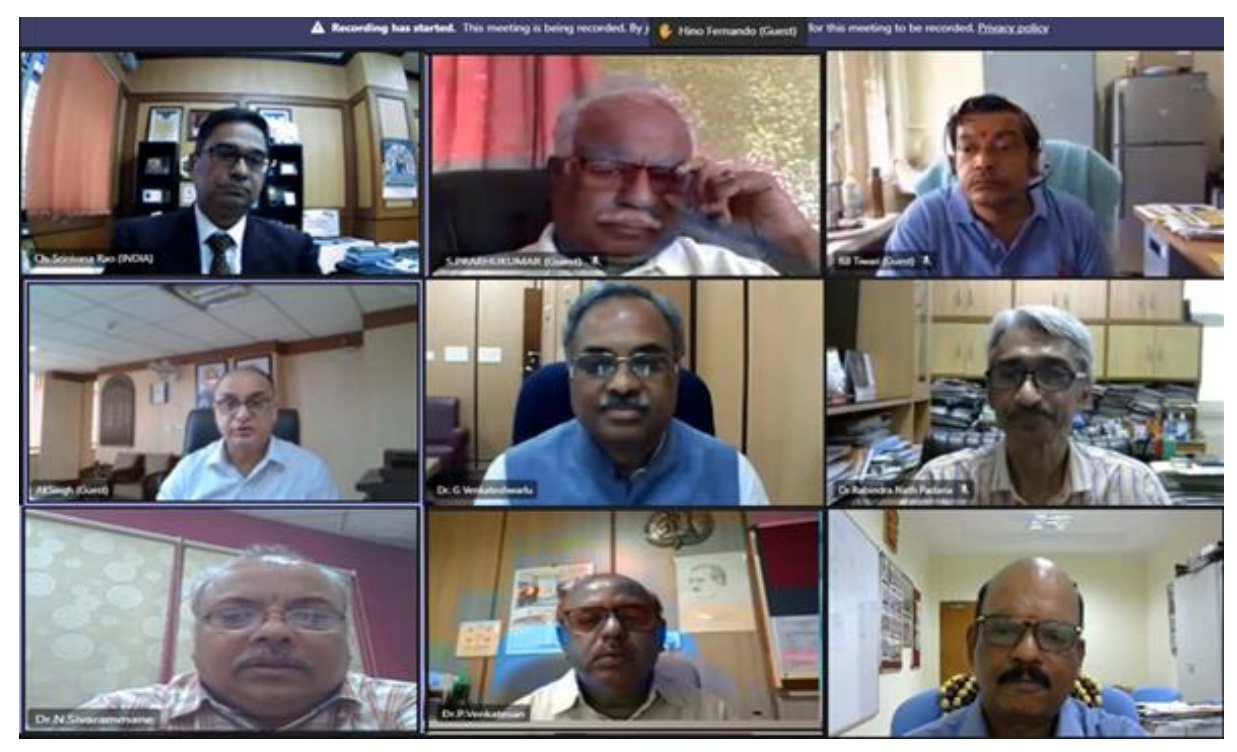
Figure 1 Inaugural session

The major suggestions which emerged from the Inaugural Session were that Extension Research needed to be more scientifically robust, be able to contribute significantly to policy decisions, and develop theories and vigorous models, which can be targeted towards SDGs and doubling of farmer's income. With regard to advances, there is an urgent need for integrating the local Agricultural Knowledge and Information Systems (AKIS) into extension research if it wants to be relevant to the diverse needs of farmers. Emphasis was laid on a supportive environment for farmer-led innovations.