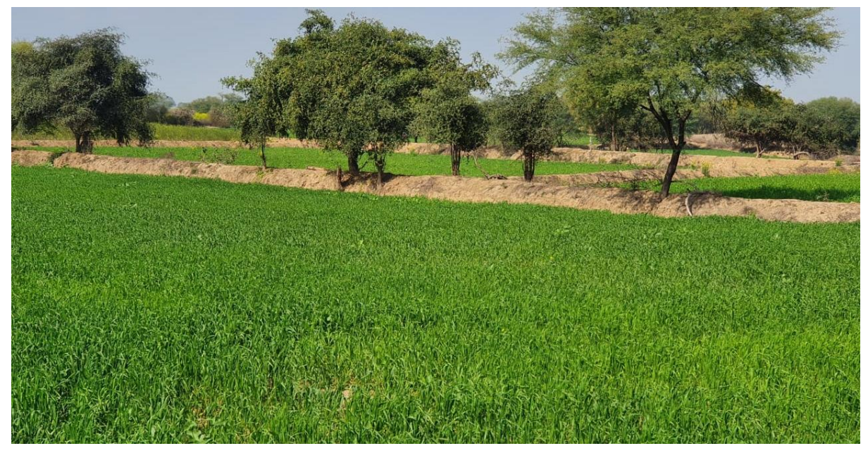
Agroforestry interventions promoted by ICAR-CAFRI in Bundelkhand Region of Uttar Pradesh

Agroforestry is emerging as a sustainable land use option for livelihood security and climate change mitigation. Though agroforestry is an age-old practice, efforts to mainstream it are fairly recent. Extension interventions play a key role in stimulating agroforestry activities and therefore, it becomes imperative to build and strengthen agroforestry extension. With several extension models available, the choice depends on existing constraints in agroforestry development and the model's appropriateness to a given set of local conditions. With this background, Food and Agriculture Organisation (FAO), ICAR-Central Agroforestry Research Institute (ICAR-CAFRI) and National Rainfed Area Authority (NRAA) developed a technical cooperation project to support implementation of National Agroforestry Policy (NAP) for enhancing tree and forest cover and for improving wood quality production.