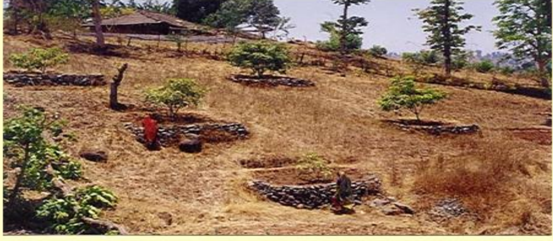
Soil conservation under wadi program