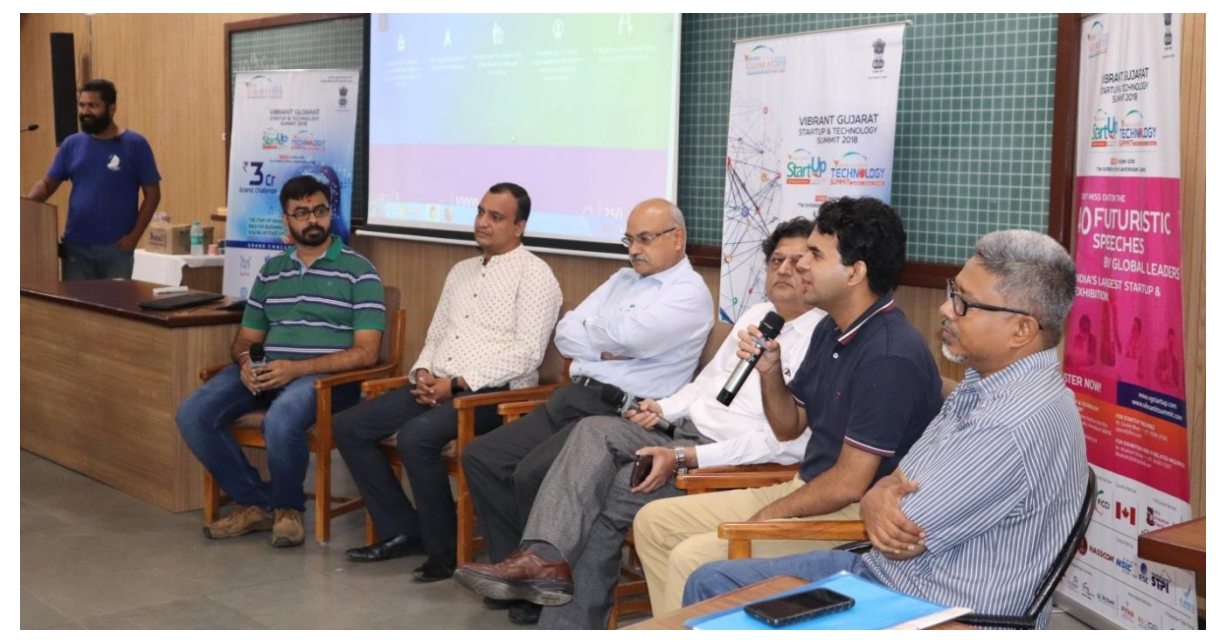
Facilitated discussion on entrepreneurship as part of a roadshow for Vibrant Gujarat Startup Summit-2018

The recent bold pronouncement by the Government of India in its Doubling Farm Income Report (Gol 2018) suggests a paradigm shift in the way we look at agriculture. Agriculture, the report suggests, needs to be seen as an enterprise and the farmer as an entrepreneur – necessitating adoption of business principles for positive net returns. The National Agricultural Research System (NARS), the report suggests, should take urgent steps to reorient and adopt a systems approach so as to include post-harvest management and monetisation, and furthermore, support farming as an enterprise and farmers as entrepreneurs. How prepared are our agricultural education systems for such a transformation and what would this mean for agricultural extension in India today? Are existing institutional arrangements in agriculture designed for productivity enhancement in any position? And, who could lead this change, given that their own experience in promoting entrepreneurship has been negligible? What should agricultural universities learn from ongoing experiments in entrepreneurial incubation and education? How should they customize this learning for the very unique contexts in agriculture today?