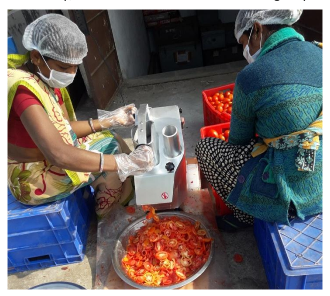
Members of Shardadevi Gramudyog Utpadak Sahakari Mandli Ltd. (SGS), Chhota Udaipur district processing tomatoes at the community level for value-addition and better income realisation.

the farmer and ensure that the farmer's ability to experiment, not just technically but institutionally, is valued and forms the basis of any structural transformation. Second, there is need for a critical rethink by the agricultural research and education systems to transform themselves into learning organisations so as to rework themselves as facilitators and co-creators of change, rather than just continuing with their erstwhile role as the sole source of agricultural innovation. Entrepreneurship is closely linked to innovation, and while it is heartening to note that many agricultural universities today are setting up incubation centres and the curriculum in agricultural education is veering towards entrepreneurship, we need to also remind ourselves that most Indian agricultural universities have not been at the forefront of entrepreneurship in the past.