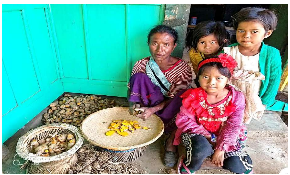
A woman farmer from Meghalaya with the harvested Lakadong turmeric

The pandemic brought on several challenges. While turmeric was deemed an 'essential' commodity, we struggled to make sales. However, the commitment to our farmers remained unwavering in those difficult times even though sales were low. The transportation of turmeric and honey from Meghalaya to Delhi was another major challenge during that time.