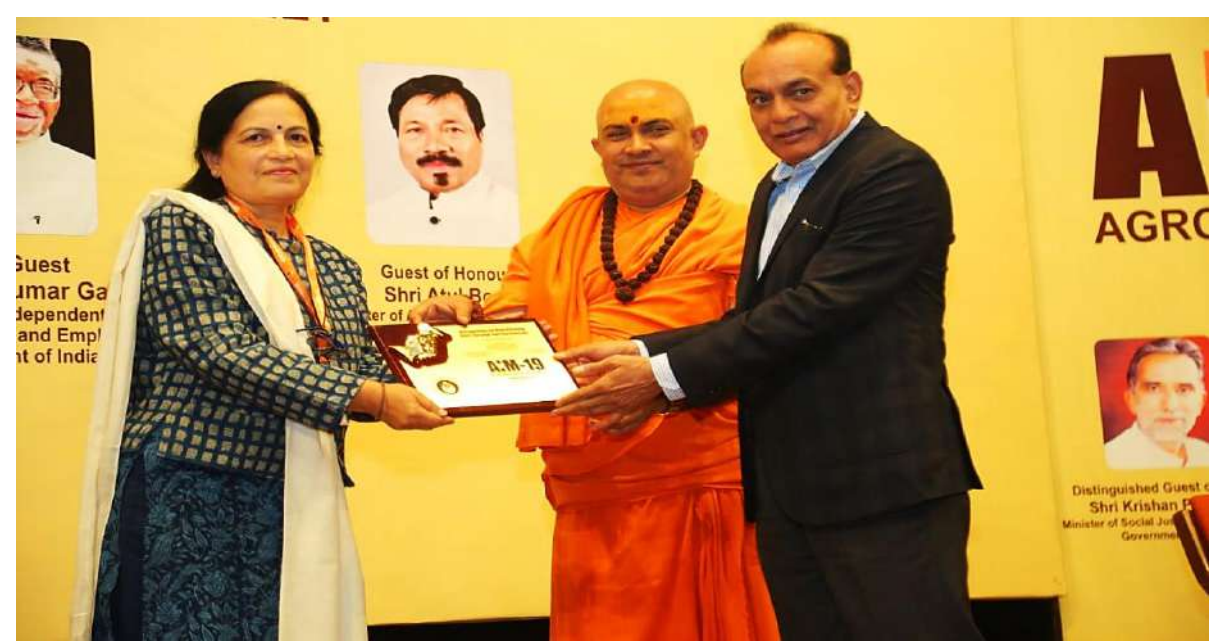
Aranyam Naturals being recognized at Agripreneur India Meet 2019

Aranyam Naturals was recognized for transforming lives through agribusiness at the Agripreneur India Meet in 2019. We were also invited by the government to participate in the World Food India Expo, 2017, a global food processing industries event.