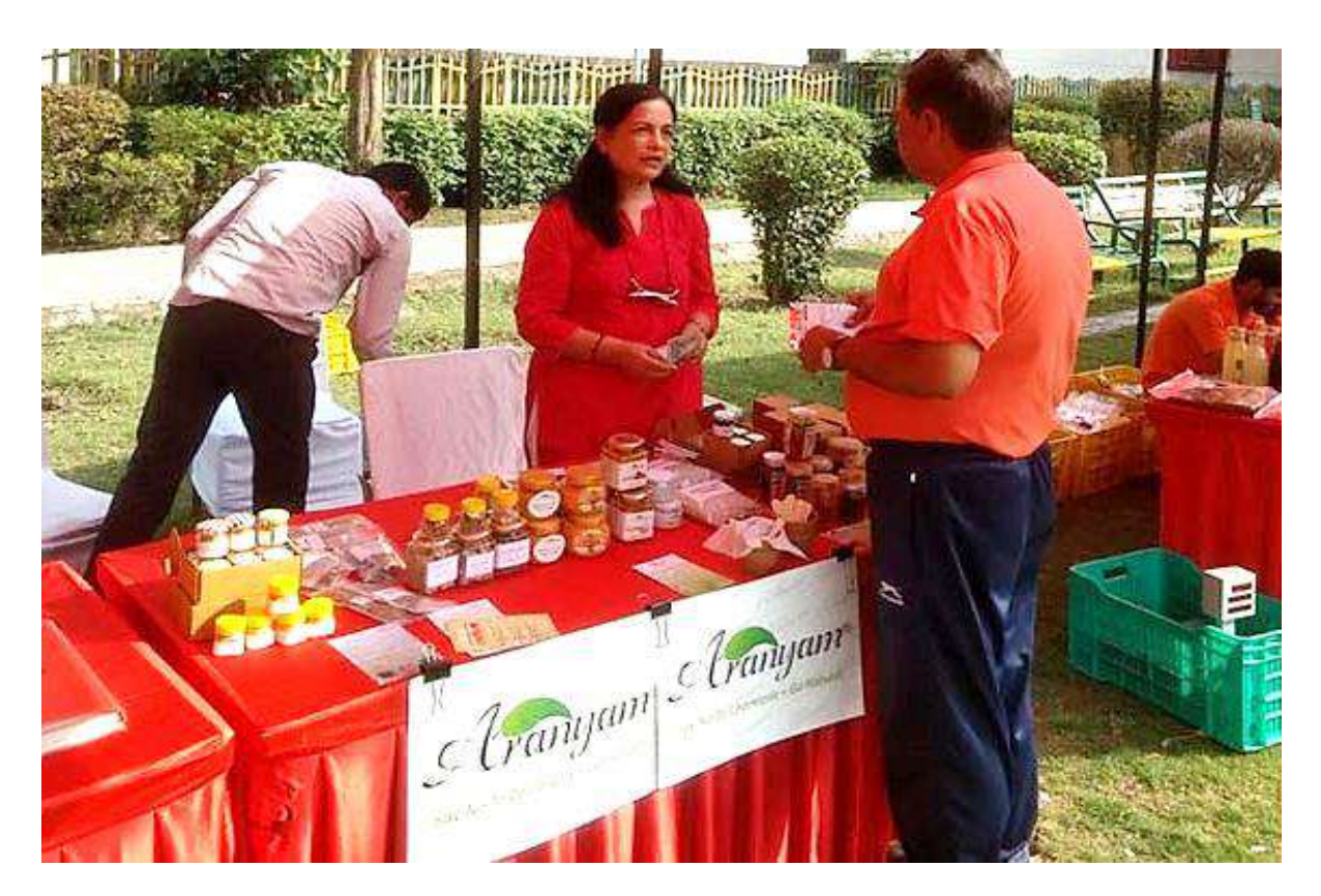
Interacting with customers at weekly artisanal market