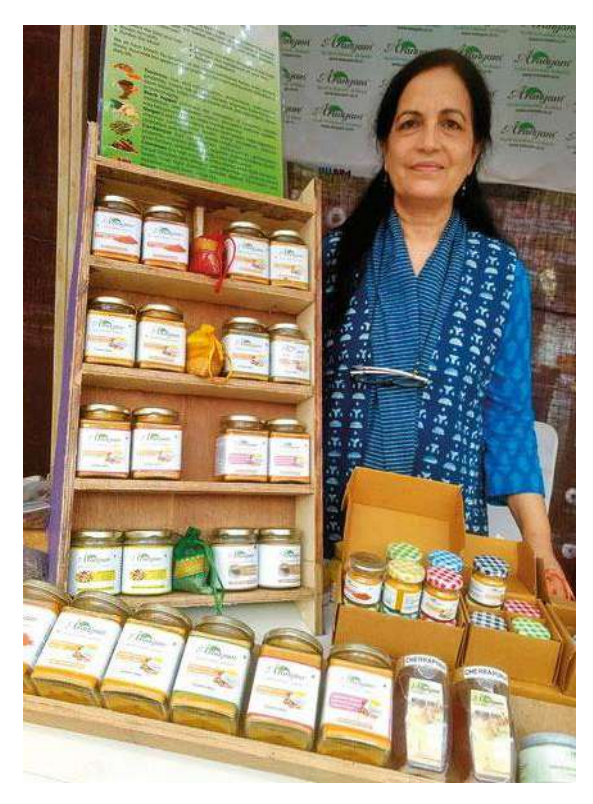
Exhibiting diverse products from Aranyam Naturals

Right from the outset, our market entry was marked by a strategic debut on Amazon, spearheading the launch of Lakadong turmeric and its intricate blends. Our sales avenues now witness a dynamic influx of orders through our website on Shopify, WhatsApp, and Instagram platforms. While we initially also explored collaborations with retail outlets, the inherent trade-offs in terms of margin absorption and delayed payment cycles prompted us to discontinue this route, with the exception of one organic retail outlet - Nature's Soul, which was very prompt with payments.