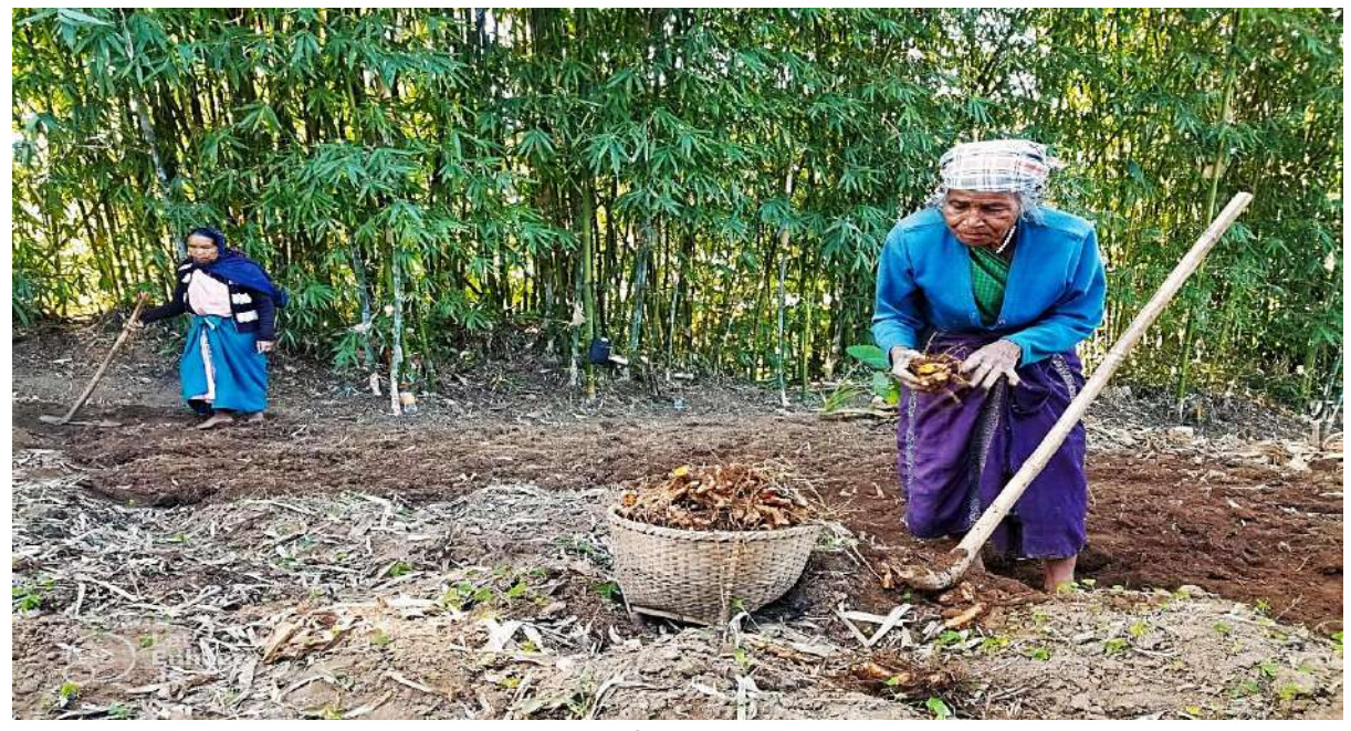
Harvesting of Lakadong Turmeric

When I look back, it is as if life decided to hit the reset button and steer me in a completely different path just when I thought I had figured it all out. Destiny, it seems, has a remarkable way of revealing itself in the most unexpected moments.