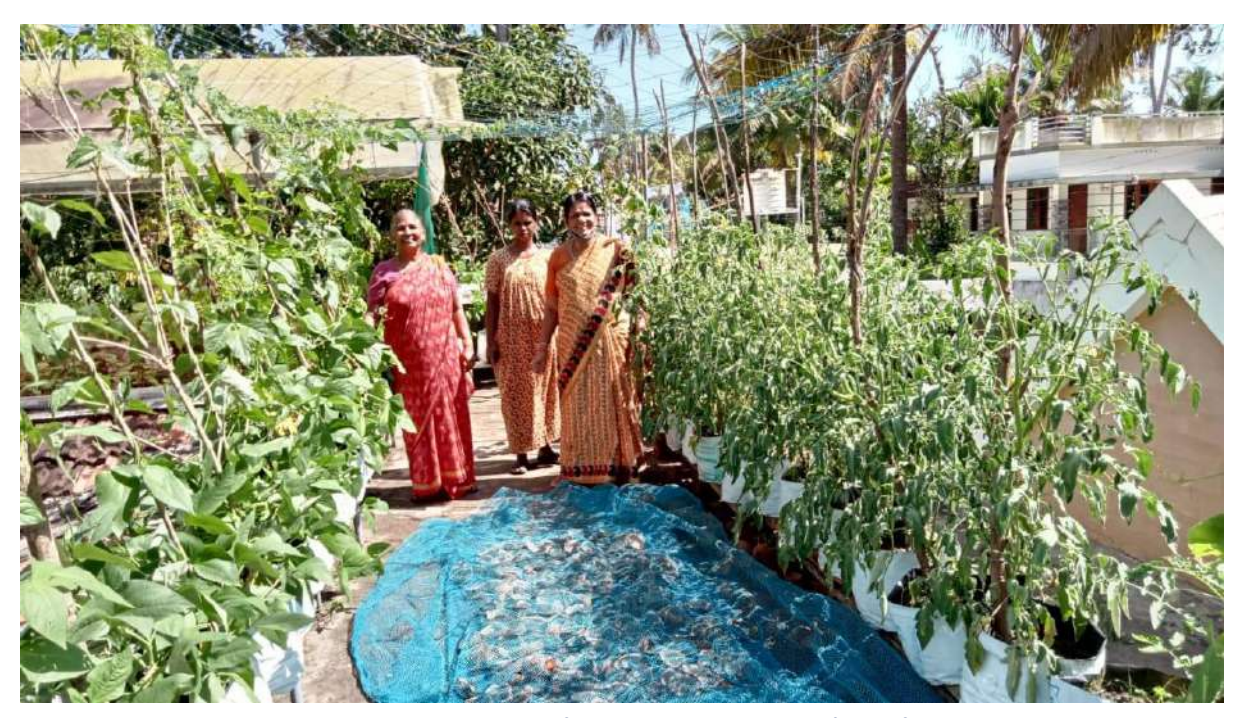
Nutrition garden promoted by Department of Agriculture and Farmer's Welfare, Kerala at Ernakulam District.

Enhancing the engagement of men in POSHAN Abhiyaan has been a mandate of POSHAN Pakhwada, but to what extent targeted activities were carried out still remains unclear. The disparities in nutrition within the household can be solved if men are also given right behavioural change communication. Nutrition-sensitive extension can be the 'Brahmastra' (or an unfailing weapon) for ending nutritional problems of the country if the right effort is put in.