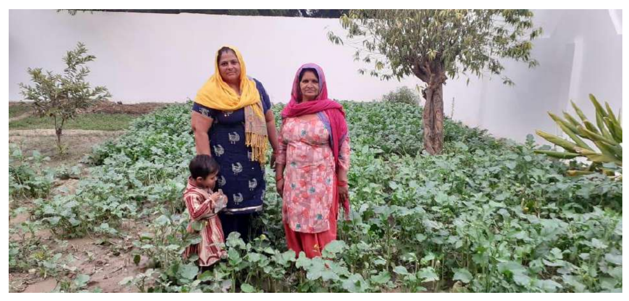
Women from Bassi (UP) in their Nutrition garden

The closure of schools in India, which are a major source that ensures meal accessibility and immunization services for children, also threatened the nutritional security of children during COVID-19. The government made appreciable efforts to support people in coping with various national and state level programmes – food grain supply through Garib Kalyan Yojana, food kit distribution, direct transfer of Mid-Day Meal cost to primary and upper primary school students, etc. But even before the COVID-19 pandemic hit, the world was already off track with regard to achieving Sustainable Development Goal 2 to eliminate hunger and all forms of malnutrition by 2030. So, the pandemic alone cannot be seen as the cause of India lagging behind in achieving these nutritional targets, rather the pandemic revealed how little progress has been made in nutritional indicators by our country.