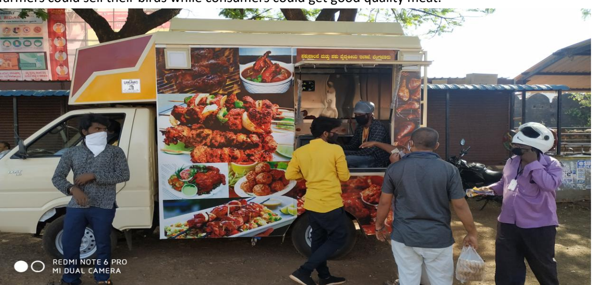
Mobile van facility "meat on wheel" for meat consumers

During lockdown period, all the meat shops were closed in the district. In this context, Department of Animal Husbandry and Veterinary Services, Bidar, and Karnataka Sheep and Wool Development Board initiated a mobile van facility "meat on wheel" for meat consumers which delivered meat while following distancing measures. Although Veterinary College, Bidar, could not be a partner in this initiative directly, it advised farmers to sell their birds to these units. Through this model, many farmers could sell their birds while consumers could get good quality meat.