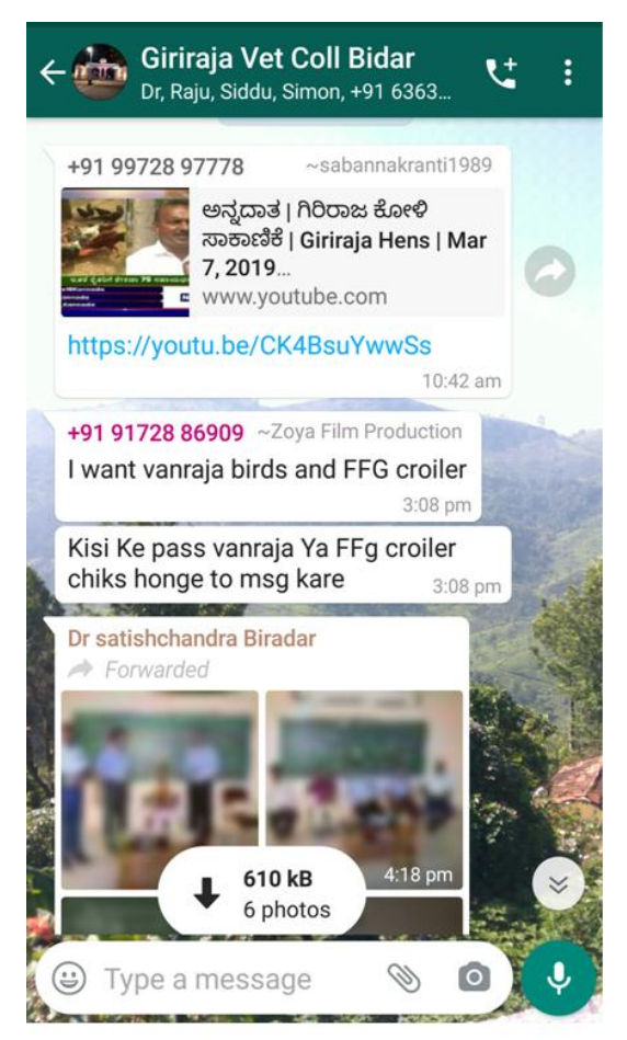
EAS- Service through WhatsApp

As most farmers faced difficulties in accessing different input and health care services, experts suggested the farmers to utilize local resources to address those issues. Some of the issues addressed were home remedies for treatment, preparation of alternative cost-effective feed resources, marketing, summer management of birds, etc. The farmers were also advised through mass media about precautionary measures to be followed during poultry rearing, marketing, meat cooking and consumption.