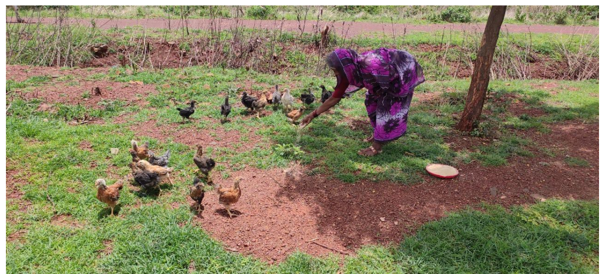
Backyard poultry rearing

During the initial phase of COVID-19, poultry farmers and sellers received reduce prices in the market compared to high production cost, ultimately leading to heavy losses to the poultry sector. The poultry breeders association estimated a loss of 22,500 crore rupees during mid-February to April (<a href="https://www.outlookindia.com/newsscroll/covid19-outbreak-poultry-sector-faces-rs-225k-crore-loss/1790419">https://www.outlookindia.com/newsscroll/covid19-outbreak-poultry-sector-faces-rs-225k-crore-loss/1790419</a>.) Further, unorganized poultry sector, also referred to as backyard poultry, which plays a key role in supplementary income generation and family nutrition to the poorest of the poor (Rathod, 2020), has also suffered heavy losses during this pandemic.