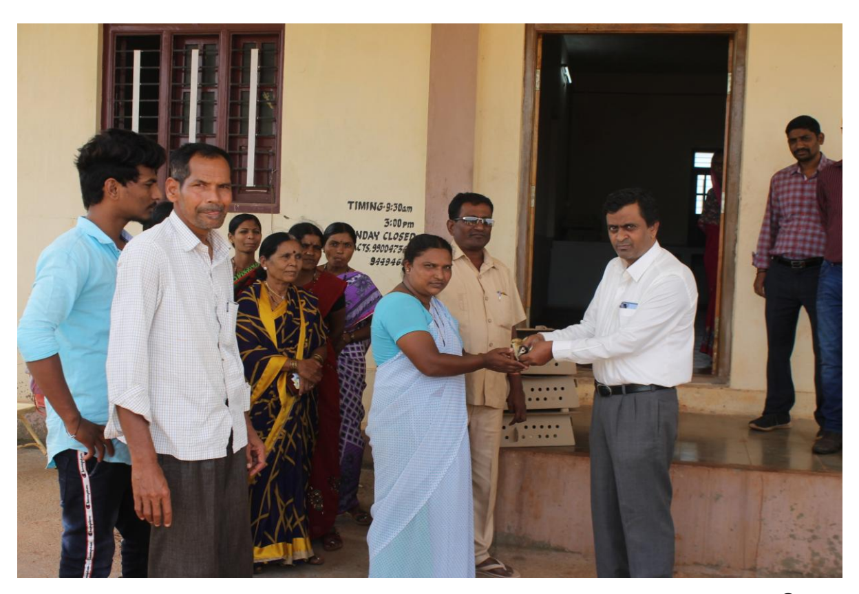
Distribution of chicks by Dean, Veterinary College, Bidar

that they were worried about the lockdown situation and did not plan to take risk by rearing those birds during lockdown period.