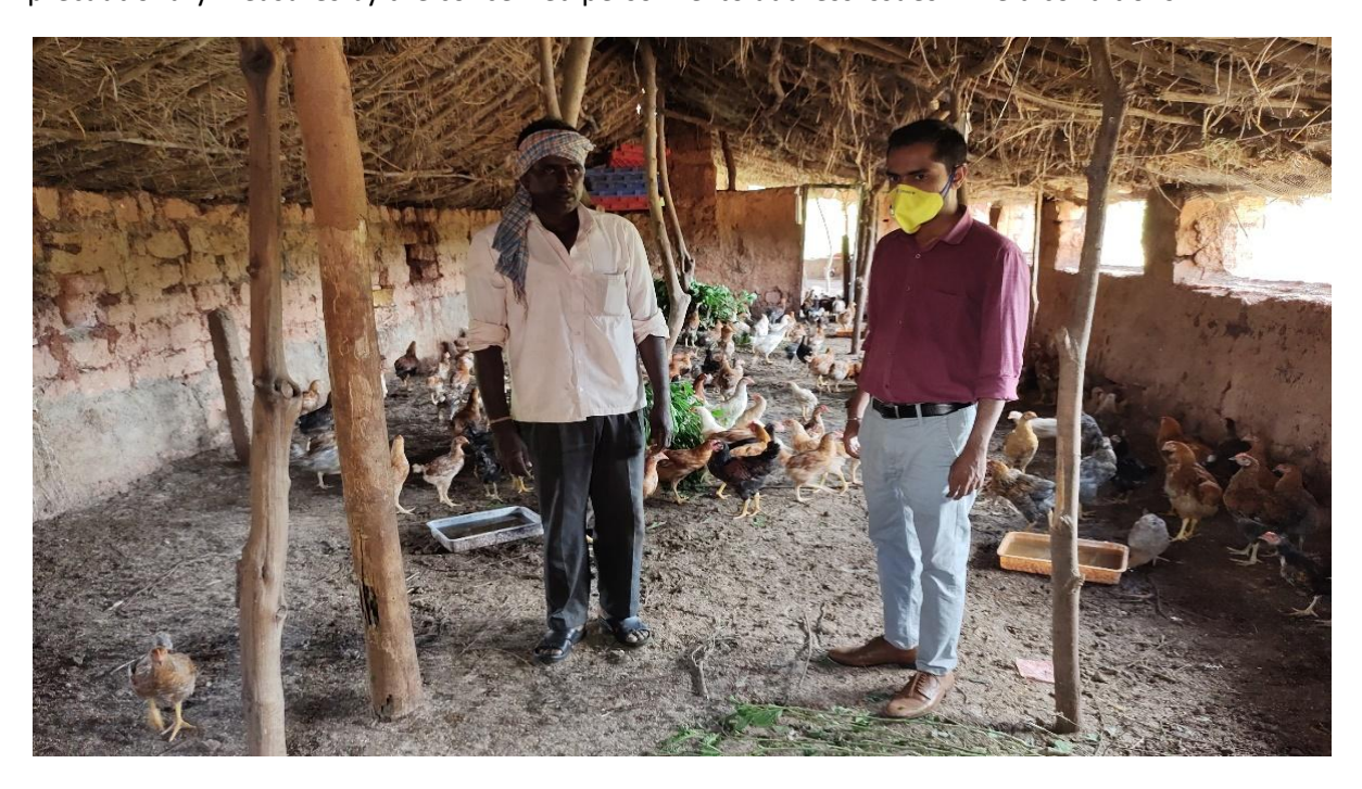
Field visit by experts of Veterinary College, Bidar

As this hatchery unit has a revolving fund and is not supported through ongoing projects, it was difficult for the experts to visit the farm or farmers in villages. This is also a common problem for majority of the government institutions bound by several rules and regulations for budget expenditure. However, upon request by the nearby farmers, field visits were conducted with all precautionary measures by the concerned personnel to address issues in field conditions.