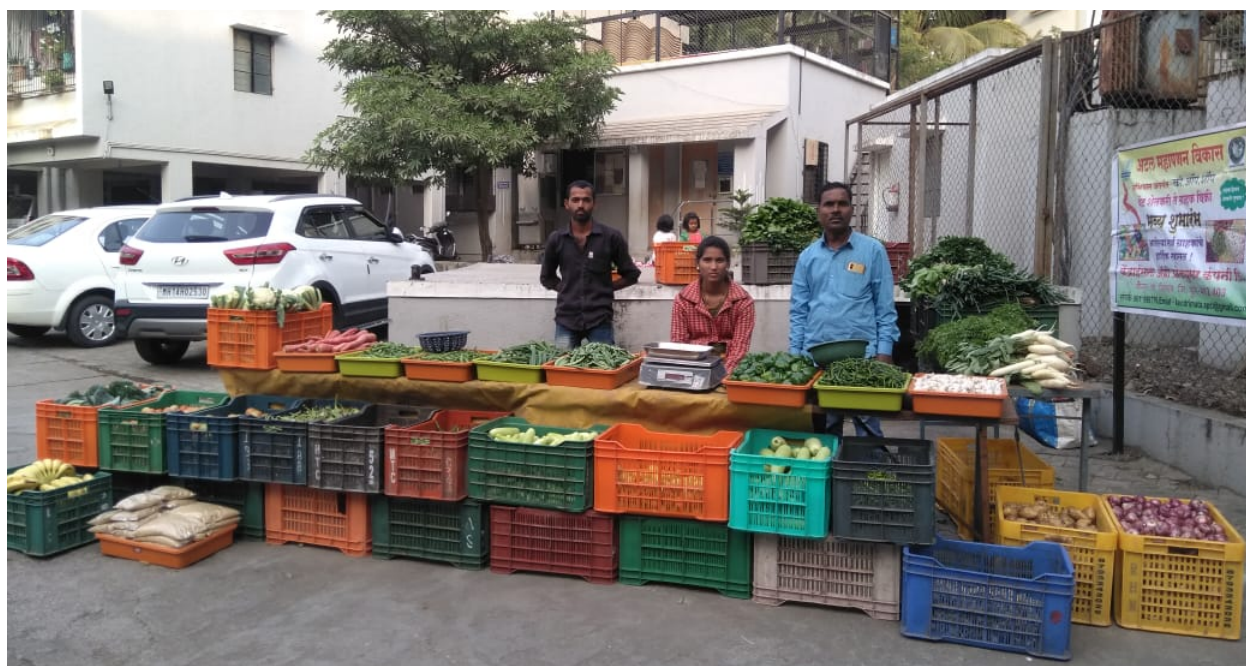
Kendraimata FPO stall outside a residential apartment in Pune

The COVID-19 crisis in India has left unharvested farm produce to rot in farmers' fields, collapsed supply chains and disturbed the transport network. In times of lockdown, farmers are finding it difficult to sell farm produce sans buyers, while urban consumers are either facing scarcity or are forced to pay a high rate for farm goods. Governments are looking towards Farmers Producer Organisations (FPOs) to be a link between producers and consumers by aggregating the produce of member farmers, collectively transporting them for sale in urban establishments. While many FPOs have come forward to operate during the COVID-19 crisis by procuring and marketing farmers' produce, and giving farmers the much needed income in this hour, their operations are not without struggles. Labour and input shortages, infrastructure bottlenecks and sometimes uncooperative local administrations prevent them from carrying out activities for the benefit of farmers and consumers. These constraints forced some of the FPOs to stop their supply chain operations.