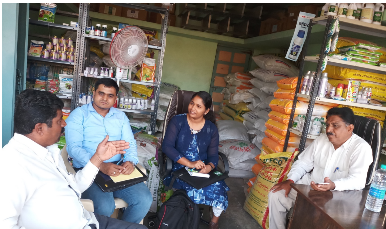
Agro-input shop of Sai Pravara Shetkari Producer Company in Ahmednagar, Maharashtra