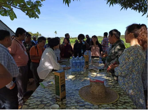
Visit at Noni Farm

The second visit was hosted by Mr. Sunil to a model agricultural operation on previously unused land now producing cash crops as per market demand. He is producing in open land and utilizing river as source of irrigation with traditional agricultural practices. As he mentioned, along with routine farming exercises, he is now investing in construction sector keeping in view that profit margin is lower in agriculture than other sectors.