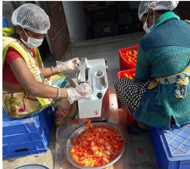
Members of Shardadevi Gramudyog Utpadak Sahakari Mandli Ltd. (SGS), Chhota Udaipur district processing tomatoes at the community level for value-addition and better income realisation.

In this blog, I suggest that the proposed transformation of agriculture as an enterprise needs two significant shifts. First, a conceptual shift in thinking that goes beyond suggesting the state as the benevolent provider of sops and subsidies that can improve farm incomes, or the belief that the ubiquitous market can solve state failure. On the contrary, there is a need to reinstate the agency of the farmer and ensure that the farmer's ability to experiment, not just technically but institutionally, is valued and forms the basis of any structural transformation. Second, there is need for a critical rethink by the agricultural research and education systems to transform themselves into learning organisations so as to rework themselves as facilitators and co-creators of change, rather than just continuing with their erstwhile role as the sole source of agricultural innovation. Entrepreneurship is closely linked to innovation, and while it is heartening to note that many agricultural universities today are setting up incubation centres and the curriculum in agricultural education is veering towards entrepreneurship, we need to also remind ourselves that most Indian agricultural universities have not been at the forefront of entrepreneurship in the past.