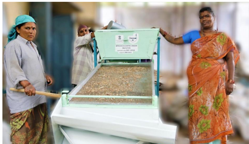
The multi-purpose grader developed by Earth 360 with support from ISEED. The machine has been designed to save power and is operated by women.

enterprise to work on their idea and helped them network with other opportunities. The innovation was a finalist at Startup India’s agriculture Grand Challenge and won special recognition at the Vibrant Gujarat Summit 201. While we did not create the innovation, we added value through other ways and continue to support their new start-up, Millet Machine Tools, as they seek to transform the millet value chain through a bouquet of machines.