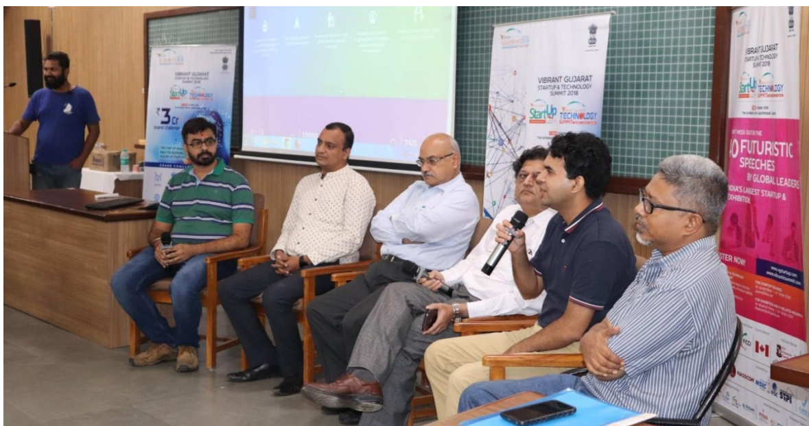
Facilitated discussion on entrepreneurship as part of a roadshow for Vibrant Gujarat Startup Summit-2018

The recent bold pronouncement by the Government of India in its Doubling Farm Income Report (GoI 2018) suggests a paradigm shift in the way we look at agriculture. Agriculture, the report suggests, needs to be seen as an enterprise and the farmer as an entrepreneur – necessitating adoption of business principles for positive net returns. The National Agricultural Research System (NARS), the report suggests, should take urgent steps to reorient and adopt a systems approach so as to include post-harvest management and monetisation, and furthermore, support farming as an enterprise and farmers as entrepreneurs. How prepared are our agricultural education systems for such a transformation and what would this mean for agricultural extension in India today? Are existing institutional arrangements in agriculture designed for productivity enhancement in any position? And, who could lead this change, given that their own experience in promoting entrepreneurship has been negligible? What should agricultural universities learn from ongoing experiments in entrepreneurial incubation and education? How should they customize this learning for the very unique contexts in agriculture today?