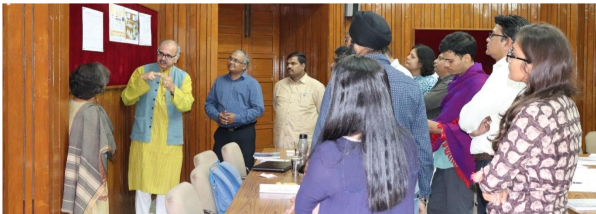
Participants collectively reviewing Business Model Canvas on BMSE at IRMA, in November 2018.

As traditional lines blur between non-profit enterprises, government, and business, it is critical that students and researchers of agricultural extension see and equip themselves to contribute to the fast-emerging social entrepreneurial ecosystem. My own experiences of teaching and innovating on pedagogy in social entrepreneurship for over a decade has pointed to the need for constant innovation in pedagogy and engagement with the external world and ecosystem. In short, academics need to be entrepreneurial as well. A big challenge often lies in trying to bring the exciting entrepreneurial world to the classroom and getting students to meet and engage with entrepreneurs through long conversations and learn first-hand from their experiments and failures. Significant learning consists in trying to link entrepreneurship with other fields of design, sociology, development, etc. For instance, the idea that start-ups are not smaller versions of larger companies and that they are often involved in the process of search and not execution. These insights have emerged in recent thinking by Steve Blank on what has been known as the 'lean start-up'.