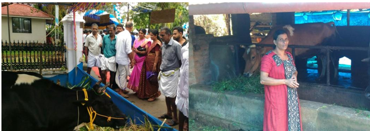
About 60% of the total enterprises established by Kudumbasree (State Poverty Eradication Mission, Kerala) are in the livestock sector.

The most important and conspicuous outcome of this intervention had been the evolution of ATMA PLUS, an institutional arrangement to overcome the limitations of ATMA. The need to customize ATMA by considering state level characteristics had been a long standing demand by many extension scientists and policy thinkers. As the authors argue, funds from ATMA had been grossly inadequate to meet the specific requirements of the state. ATMA PLUS has rendered ATMA more effective by adding new mandates and additional funds for forming groups, mobilising resources and creating innovative learning situations at the field level. More importantly, this approach also involves formulation of location specific development programmes under the aegis of local self-governments, enabling seamless integration with decentralized planning.