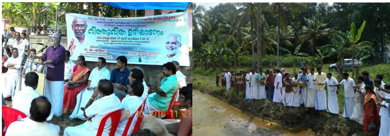
People’s representatives play a very important role in agricultural development in Kerala. A scene from Onamthuruthu padashekaram under Neendur Krishi Bhavan

The progression of extension initiatives from the Economic Conference of Mysore (1914-18) to Etawah Pilot Project (1948) shows how the development perspectives, approaches and tools have changed during the pre-independence period and how they have contributed to the strategies of agricultural and rural development in independent India. Sad to say, the dynamics of this change in relation to the political transition in India has not been seriously understood by extensionists. However, the authors present the sequel to the development narrative of yesteryears, by briefly explaining the current initiatives, which are huge by scale and triggered by multiple agencies and actors. Similarly, the history and evolution of agricultural development and extension in Kerala has also been documented with rich evidences drawn from a wide range of authentic sources. Though the authors have exercised great caution in documenting the major historical milestones chronologically, emphasis seems to have been given to agriculture in the southern part of the state alone, with brief explanations of the contributions of some prominent rulers of Travancore. An account of similar interventions in Cochin and Malabar regions has not found a place in this section.